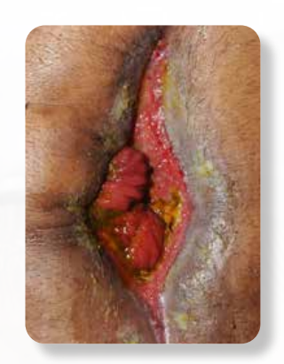
Product used: 839265 extra large eakin Wound Pouch™